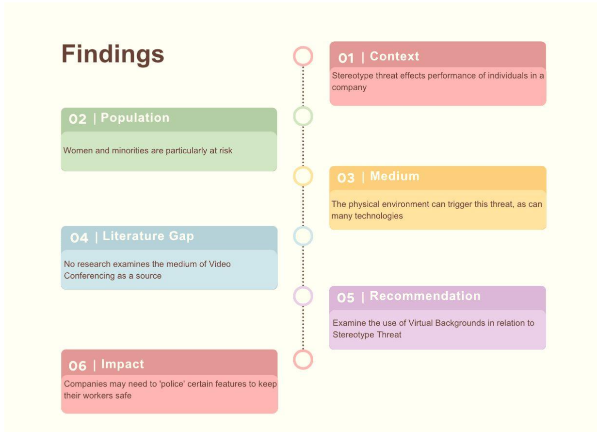
Figure 3: A synopsis of the findings of the SLR