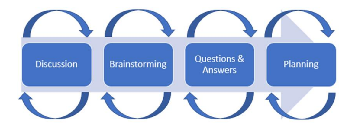
Figure 1: The communication process for students' synchronous, in-person meetings.

Alternatively, when team members were unable to meet in-person because of COVID-19, they chose to meet asynchronously using WhatsApp and Google Docs. Participants described how the absence of body language had an adverse effect on the communication process. Specifically, participants described their not being able to identify who was actively contributing to the meeting and who was not. In addition, participants commented that communicating virtually via WhatsApp facilitated a passive rather than active engagement in the communication process. The effect of these factors was fewer ideas proposed and less discussion. A student declared: