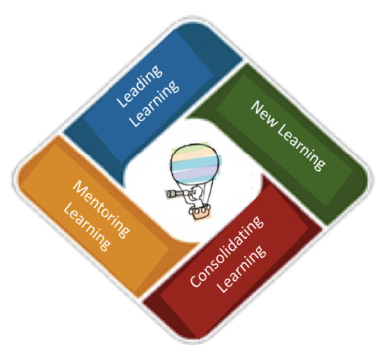
Figure 2:The four types of learning supported by the PDF

Further, the clear typology of the different types of professional development activity identified provided a common language for PD activities across the sector (Figure 3)