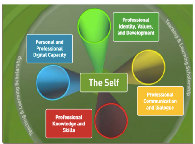
Figure 1: The five domains of the national Professional Development Framework

Two further domains, Professional Identity and Development and Professional Knowledge and Skills recognise that an individual may have a range of professional identities throughout their career, and ensures the individual reflects on the currency of their professional/disciplinary knowledge to keep it current. During the consultation process, there was no consensus as to whether building digital capacity should be included as an explicit domain or integrated across all domains. However, the explicit inclusion of the domain Personal and Professional Digital Capacity recognises that we live and work in a digital world, and that those who teach must develop their personal digital skills to have the self-assurance to harness the potential of technology for learning impact.